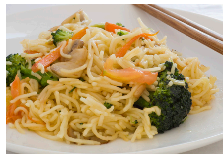
Chicken Chow mein