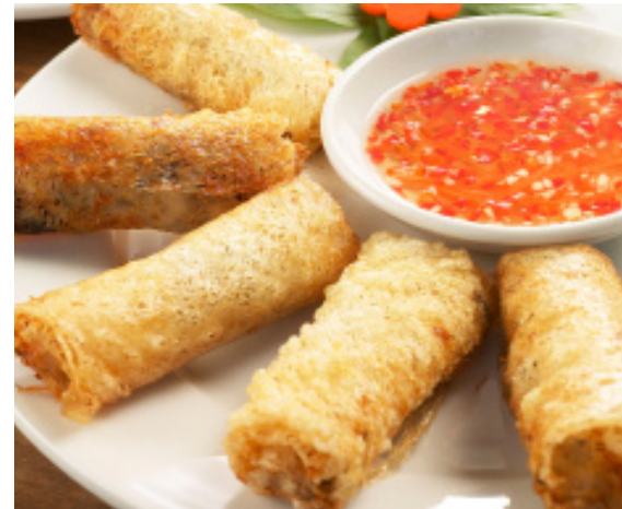
Vegetarian Spring Rolls sm 3.50 $6.25 Served With Sweet Chili Sauce.

HOMEMADE GINGER SOY DIPPING SAUCE Add Fresh Veggies $3 a side